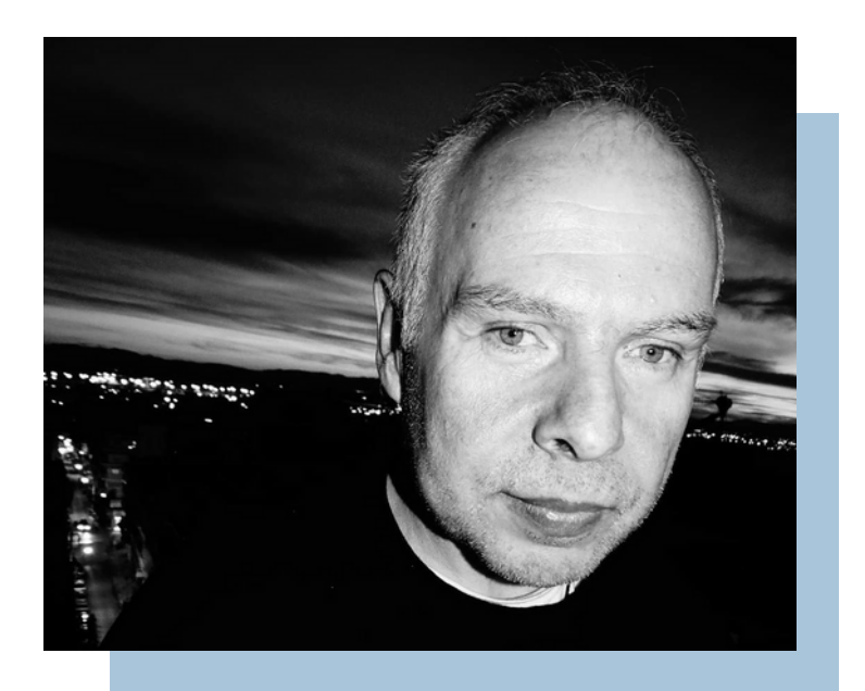
The Winning Photophaph by Asterios Karadoylamas from the Residential Home of Neapolis

<u>Here</u> you can watch the video of the exhibition that focuses on the perspective and the meaning the creators give to their photos.