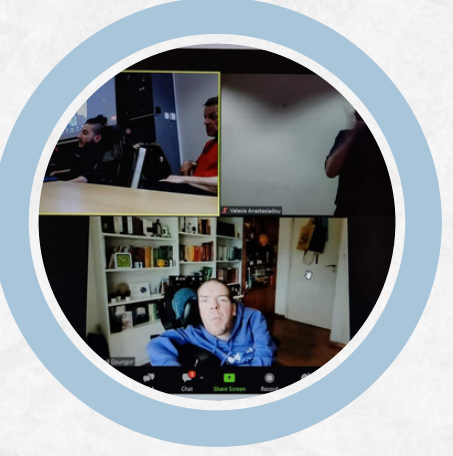
Conference May 6th