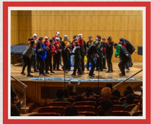
Center of Creative Activities for People with Disabilities of Neapolis & Sykeon - Theater performance: "The birds of Aristophanes" (adaptation) -