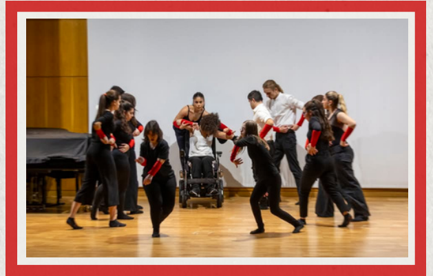
RoDance (inclusive dance group) - Dance performance