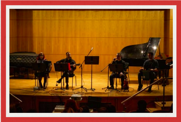
RoDi Music Orchestra - Music Performance for the 6th iRoDi Festival