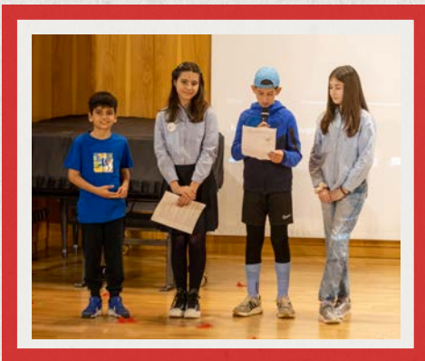
23rd Primary School of Thessaloniki - Short film: "Blue cocktail without alcohol"